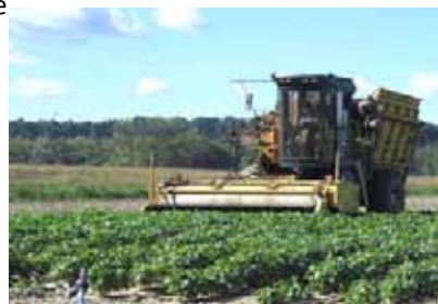
FWA grows, harvests, and processes wholesale green beans in huge quantities, while diversifying into grain corn and a plethora of vegetables for their farm stand and CSA customers.