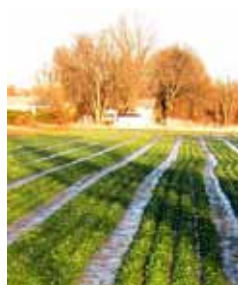
Anderson Farms. Spinach: planted in October, ready to eat in May. Spring plowing. Sweet corn tassels spreading pollen on the wind.