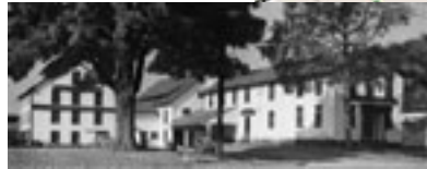
Comstock Ferre, & Co.