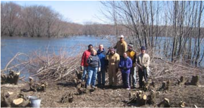
Volunteers working to restore the meadow on the DeMille easement, March 2008. Supported by WHIP grant, GMCT is working to restore the wet meadow habitats and the sweeping view of the 1968 photo of the founders of the Trust on the next page.