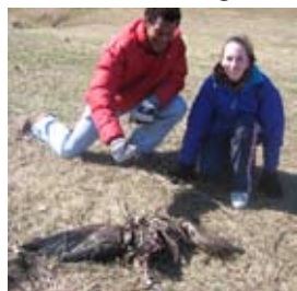
WHS volunteers check out a goose, banded in Berlin, eaten on the cove.

Volunteers devoted many hours of work on behalf of the Trust. Along the Cove in the Wolf parcel and De-Mille easement, meadows restoration proceeded with removal of invasive species brush, cut by B&B Landscaping, and chain-sawing and piling of red maples in addition to the ongoing flotsam removal. Discovery of the banded goose was an educational plus, along with the lessons in stewardship and community service.