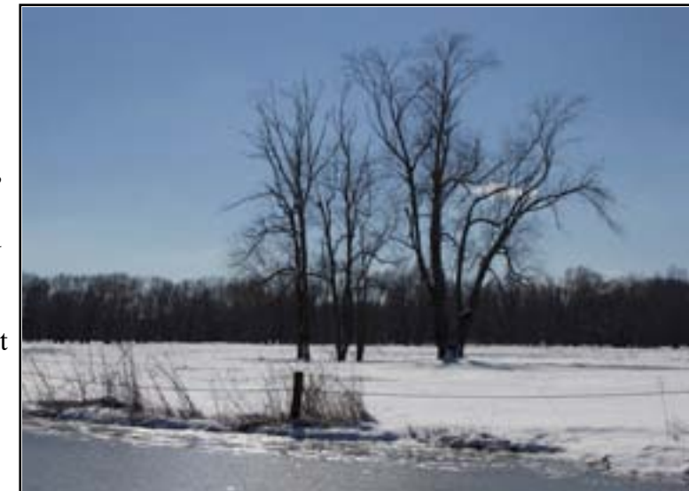
When is a tranquil snow covered meadow especially sweet? When you know the snort and whine of motocross engines have given way to the hum of tractors and the trill of birdsong. CT River Motocross Park 1995 – 2017

On the Wood Parcel we replaced a 50 year old culvert. We formalized a hunting agreement with the Wethersfield Game Club and joined with Rocky Hill farmers in their efforts to close the meadows to vehicular traffic. We joined with Goodwin College to host a walking trail through our properties in