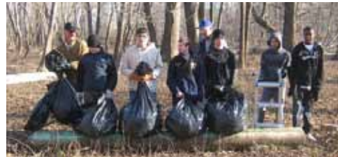
Wethersfield High School Community Service Volunteers remove floatables from Folly Brook banks.

The floodplain was a lot cleaner after 6 Wethersfield High School community service volunteers