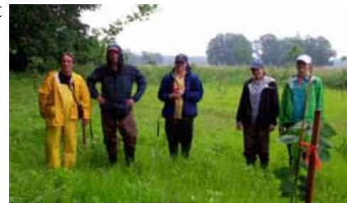
GMCT's elm plantation survived Japanes beetles in July, floods in August and September and the October snow storm

provided by TNC forester Christian Marks. Still the second most common species in the forest, the hope is to restore the elm species to its former glory as the dominant species in the flood plain forest.