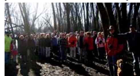
107 walkers view flood plain on sunny warm morning

scrounged among the poison ivy and mud to gather plastic and aluminum bottles swept off the streets of